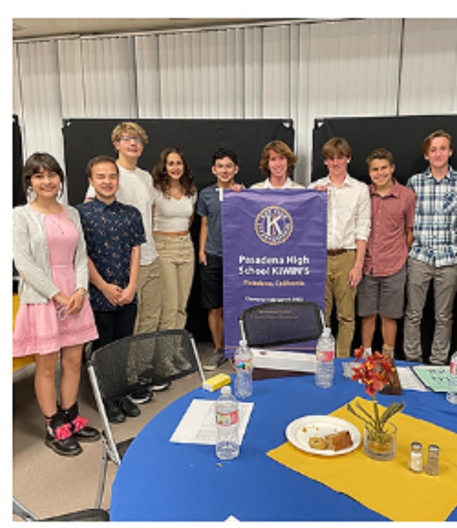
KIWIN'S CLUB Neighbors Helping Neighbors Youth Service Award